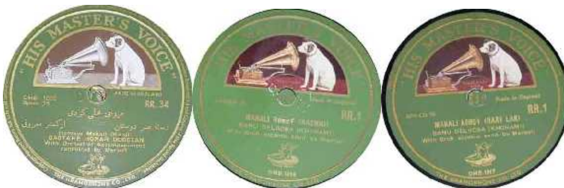
1947- His Master's Voice : Recordings by Delroba (RR.1) and Maroofi orchestra (RR.34)